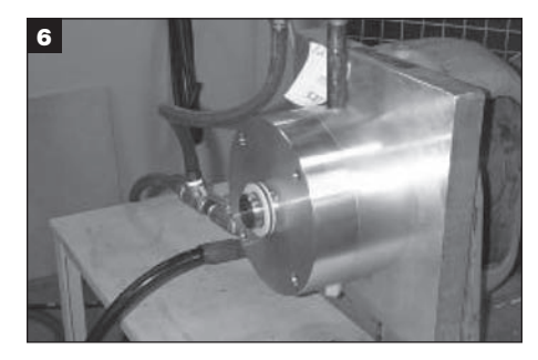
The shim stock can be removed.

CAUTION: Rotating the seal in the opposite direction will cause damage to the seal.